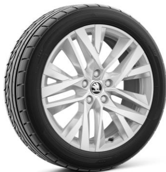
18" Lerna silver alloy wheels (Code )