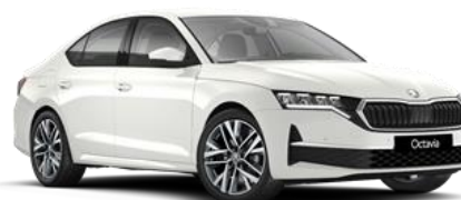
Candy White (9P9P - Solid)