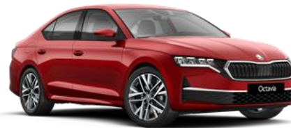
Velvet Red (K1K1 - Exclusive)