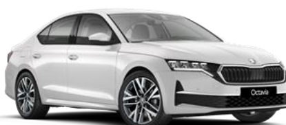
Moon White (2Y2Y - Metallic)