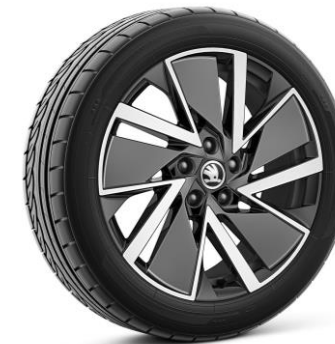
18" Vega aero alloy wheels (Code )