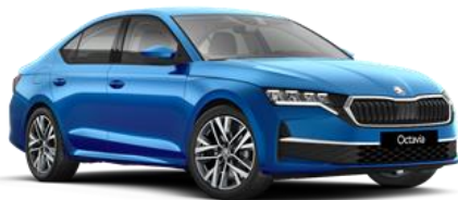
Race Blue (8X8X - Metallic)