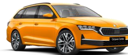
*Phoenix Orange (2X2X - Exclusive)