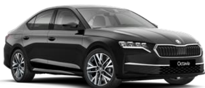
Black Magic (1Z1Z - Metallic)