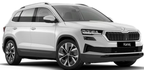
Moon White (2Y2Y – Metallic)