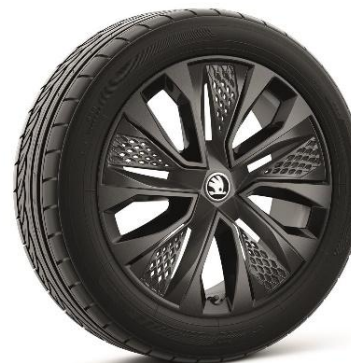
18" Procyon Black incl. black aero inserts (Code C31)