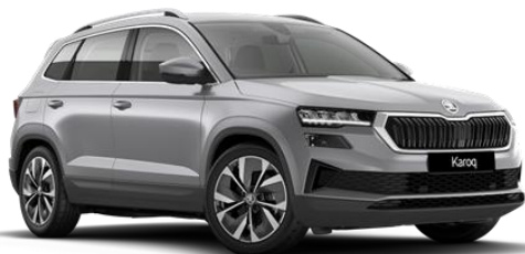
Brilliant Silver (8E8E – Metallic)