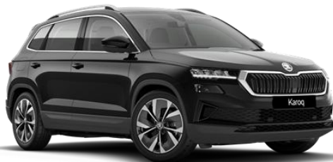
Black Magic (1Z1Z – Metallic)