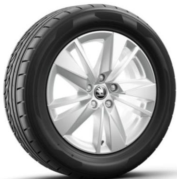
17" Scutus Silver alloy (Code U47)