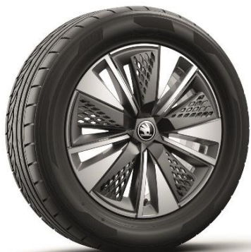
17" Scutus Silver incl. black matt aero inserts (Code U47)