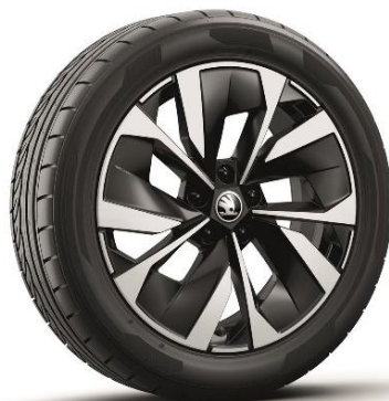
18" Miran Black aero alloy (Code C21)