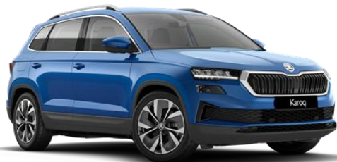
*Energy Blue (K4K4 – Solid)