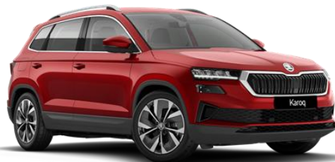
Velvet Red (K1K1 – Exclusive)