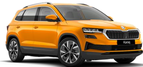
Phoenix Orange (2X2X – Exclusive)