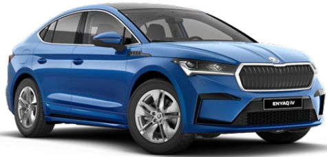
Energy Blue (K4K4 - Solid)