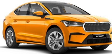
Phoenix Orange (2X2X - Exclusive)