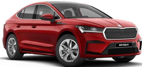
Velvet Red (K1K1 - Exclusive)