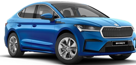
Race Blue (8X8X - Metallic)