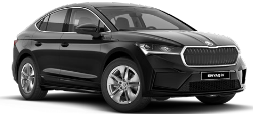
Black Magic (1Z1Z - Metallic)