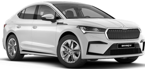
Moon White (2Y2Y - Metallic)