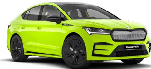
*Mamba Green (I3I3 - Solid)