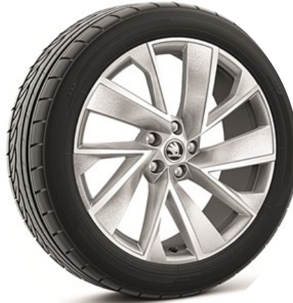
20" 'Vega' alloy wheels (Code PCA / PCD)