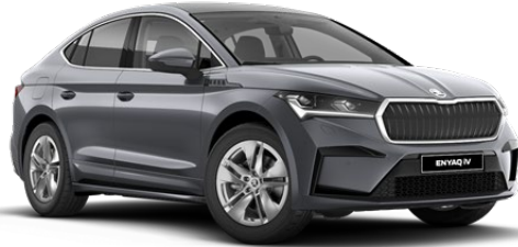
Graphite Grey (5X5X - Metallic)