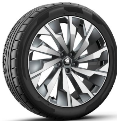
21" 'Supernova' anthracite alloy wheels (Code PJT)