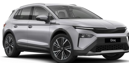
Brilliant Silver (8E8E - Metallic)