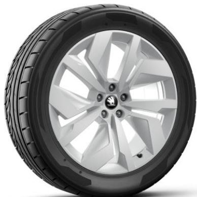
20" 'Vega' alloy wheels (Code PJD)