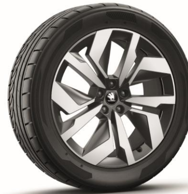
20" 'Vega' alloy wheels (Code CB2/65Q)