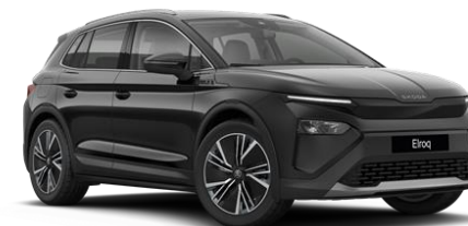
Black Magic (1Z1Z - Metallic)