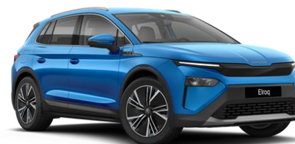
Race Blue (8X8X - Metallic)