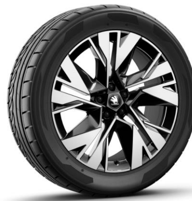
20" 'Asterion' alloy wheels (Code U19/65S)