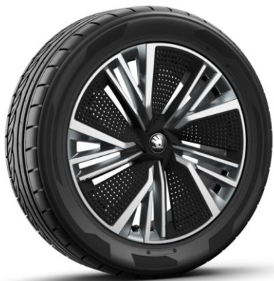
20" 'Neptune' alloy wheels (Code 40T/56H)