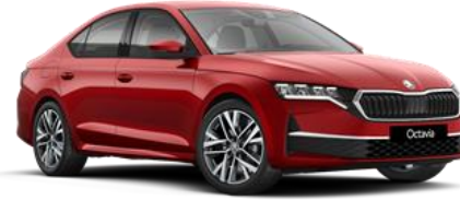
Velvet Red (K1K1 – Exclusive)