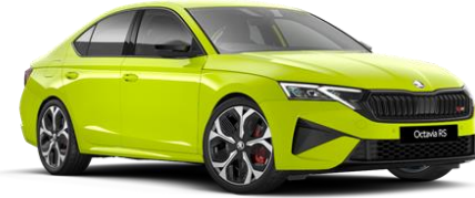
Mamba Green (9P9P – Solid)