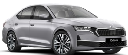
Brilliant Silver (8E8E – Metallic)