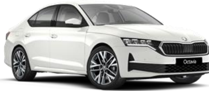
Candy White (9P9P – Solid)