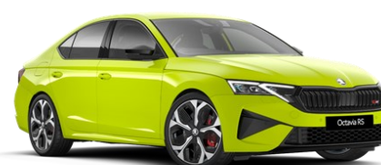
Mamba Green (9P9P – Solid)