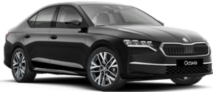
Black Magic (1Z1Z – Metallic)