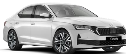
Moon White (2Y2Y – Metallic)