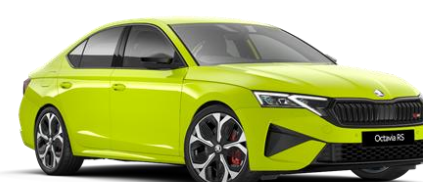
Mamba Green (9P9P – Solid)