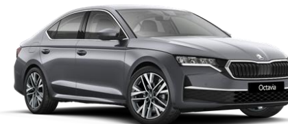
Graphite Grey (5X5X – Metallic)