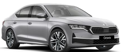
Brilliant Silver (8E8E – Metallic)