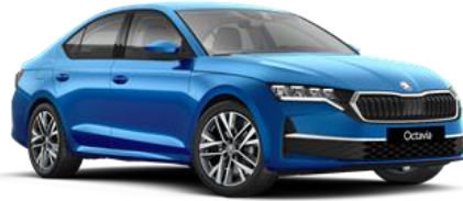
Race Blue (8X8X – Metallic)