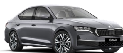
Graphite Grey (5X5X – Metallic)