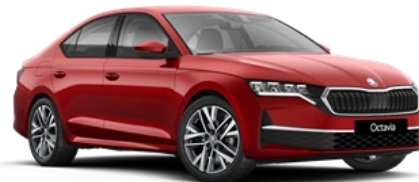
Velvet Red (K1K1 – Exclusive)