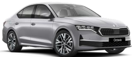
Brilliant Silver (8E8E – Metallic)