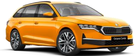
*Phoenix Orange (2X2X – Exclusive)