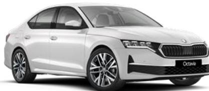
Moon White (2Y2Y – Metallic)