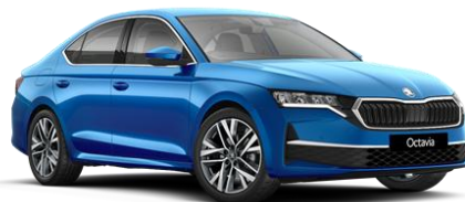
Race Blue (8X8X – Metallic)