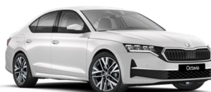
Moon White (2Y2Y – Metallic)