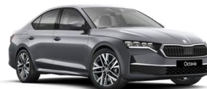
Graphite Grey (5X5X – Metallic)