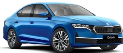
Race Blue (8X8X – Metallic)