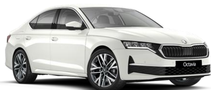
Candy White (9P9P – Solid)