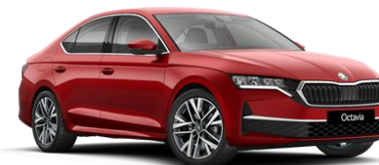
Velvet Red (K1K1 – Exclusive)