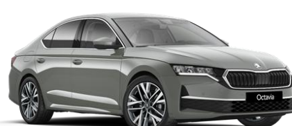
Steel Grey (M3M3 – Solid)