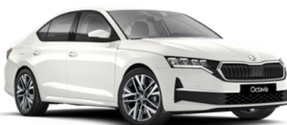
Candy White (9P9P – Solid)