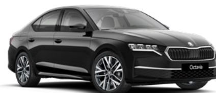
Black Magic (1Z1Z – Metallic)