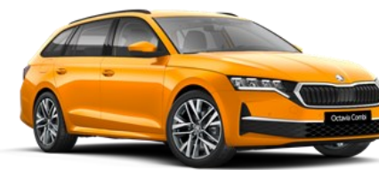
*Phoenix Orange (2X2X – Exclusive)