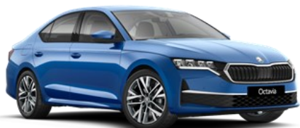
*Energy Blue (K4K4 – Solid)