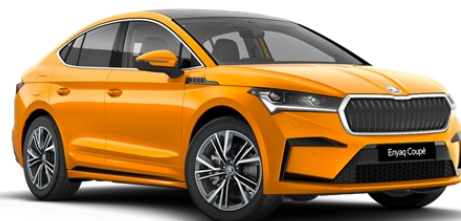
Phoenix Orange (2X2X – Exclusive)