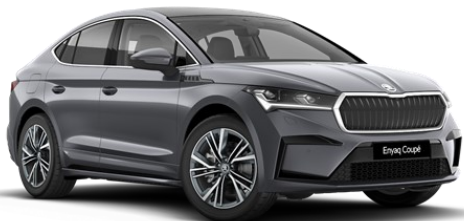
Graphite Grey (5X5X – Metallic)