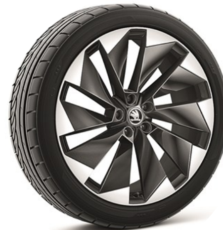
21" 'Supernova' alloy wheels (Code 7CA)