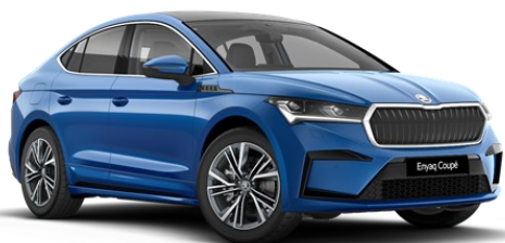
Energy Blue (K4K4 – Solid)