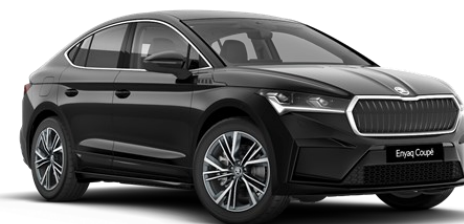
Black Magic (1Z1Z – Metallic)