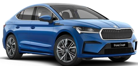
Energy Blue (K4K4 – Solid)