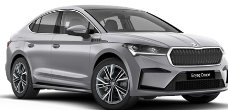
Brilliant Silver (8E8E – Metallic)