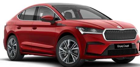
Velvet Red (K1K1 – Exclusive)