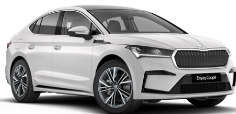
Moon White (2Y2Y – Metallic)