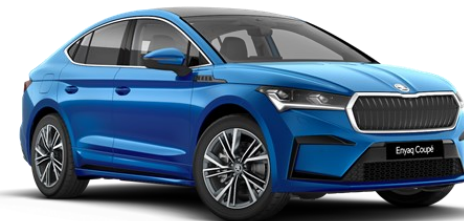
Race Blue (8X8X – Metallic)